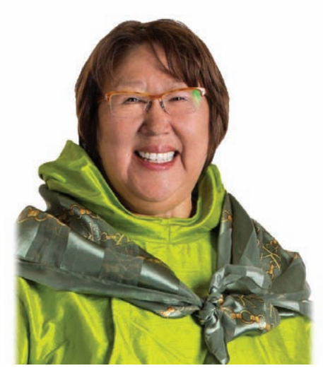
Mayor Charlotte Brower

The municipality that I represent, the North Slope Borough, spans an area of over 94,000 square miles across Alaska's North Slope – that is 23,000 square miles larger than the entire state of Washington. It is not an area, however, that is untouched as your letter asserts. The majority of our nearly 8,000 full-time residents are Inupiat