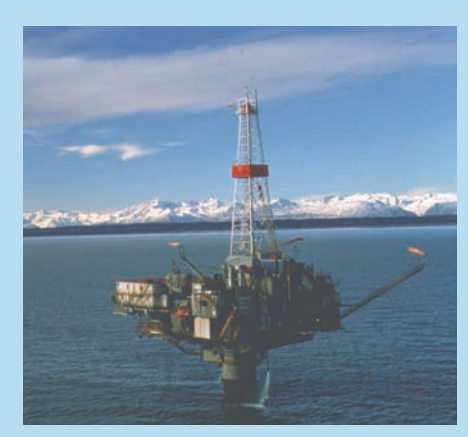
Shell pioneered the first oil and gas development in Cook Inlet in the 1960s.

The National Petroleum Council, an advisory commission to the U.S. Department of Energy, recently warned that the U.S. should