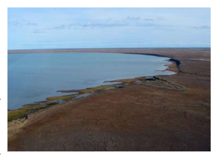
Under the preferred alternative, the Teshekpuk Lake Special Area, which prohibits future leasing and development, has been expanded to cover a large highly-prospective area of the energy reserve.

Only one or two meetings of BLM employees with all the cooperating agencies occurred, Parnell said. One of those meetings was after the announcement of the preferred alternative. At the latter meeting, BLM informed the State that the preferred alternative would not change, despite concerns expressed by the State, the North Slope Borough, and Arctic Slope Regional Corporation (ASRC).