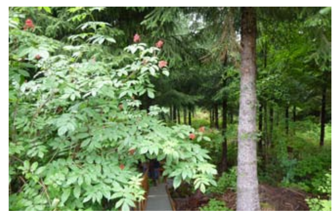
Sealaska has pruned the lower limbs from 15 to 20 year-old trees over 3,500 acres, allowing more sunlight to reach the forest.

The Southeast Alaska Native corporation has invested over $19 million in planting,