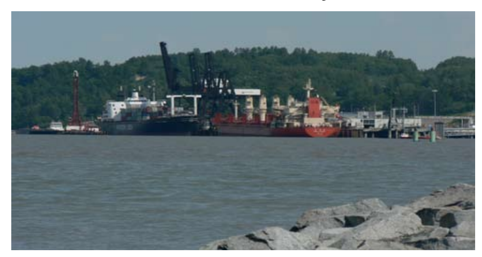
The EPA's new offshore emission rules for ocean vessels operating to and from Alaska will mean significantly higher prices for virtually all goods sold in Alaska.

The Center for Biological Diversity, the Environmental Defense Fund, Friends of the Earth, and the Natural Resources Defense Council have asked to intervene in support of the federal government.