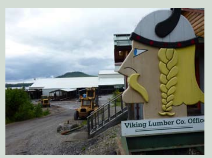
The family-owned Viking Lumber Company in Klawock operates the last remaining medium-size sawmill in Southeast Alaska. Other mills have closed due to a severely constrained timber supply.

As the 2008 Tongass Land Management Plan was nearing completion, the Forest Service informed AFA it planned to offer about 140 mmbf of timber annually for the following five-year