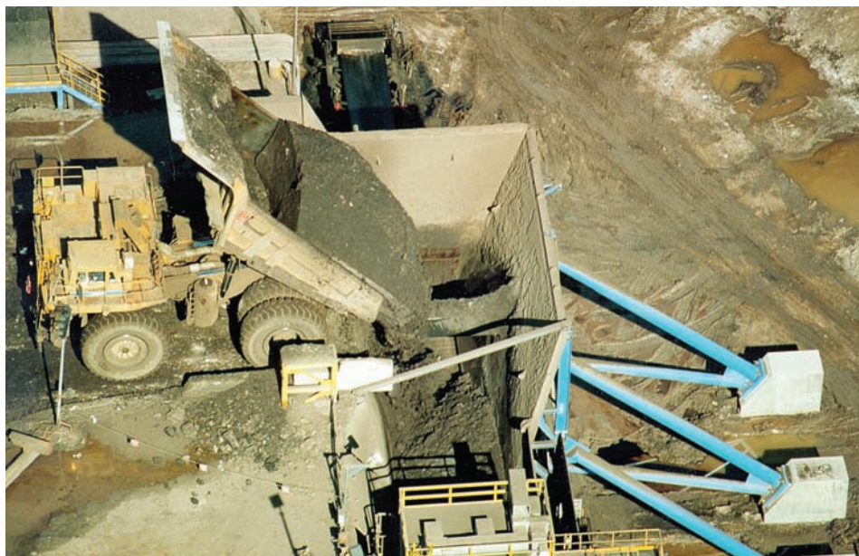
Crushers and sizers break up the ore for delivery to the extraction plant.

Bitumen is recovered in two ways. For oil sands near the surface, about 500,000 tons are mined each day using huge mechanized shovels with buckets that hold 100 tons. The ore is transported in some of the world's largest trucks, carrying 400 tons per load, to