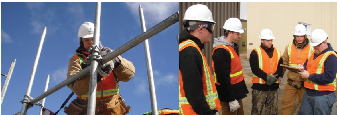
CH2M HILL students at the King Salmon training facility - April 2010 2009 Employer of the Year by Alaska Department of Labor and Workforce Development

Through Workforce Development CH2M HILL has been able to recruit and retain skilled labor for our North Slope jobsites, establish relationships with future clients and strengthen our alliance with our current business partners.