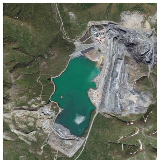
An aerial view of the Red Dog Mine shows the mill facilities, the ore pit and the tailings pond. The Aqqaluk deposit is adjacent to the main pit.