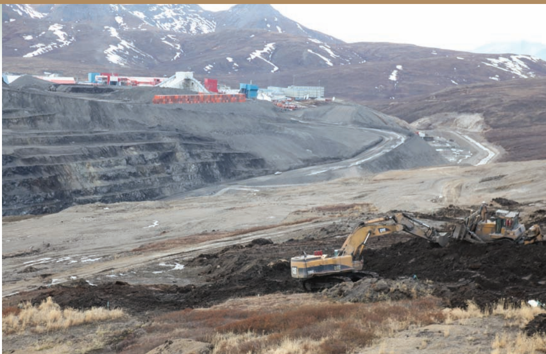
Teck Alaska has begun preparing the Aqqaluk deposit site for development. Part of the main pit and mill facilities at Red Dog are visible in the background.