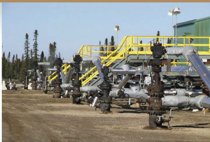
At left, raw bitumen is separated from the sand, water, and clay at the extraction plant to prepare for upgrading. At right, the in-situ process uses steam assisted gravity drainage technology to inject steam into the oil sands and collect the bitumen released by the heat. The recovered bitumen is sent by pipeline to the upgrading facility. The process does not require extraction as separation occurs in the ground.