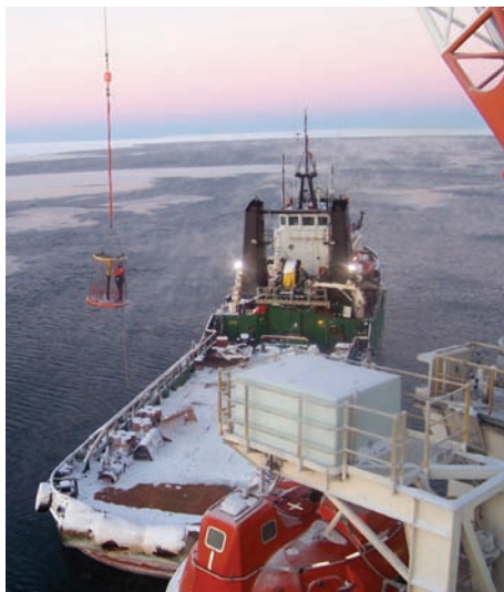
Shell mobilized its drilling fleet in 2007 for Arctic exploration, but was forced to pull back. Once again its plans have been halted as the federal government put a freeze on new OCS drilling in the Arctic.

U.S. Secretary of Interior Ken Salazar said the White House put a freeze on offshore drilling in the Arctic until after the findings are released from a presidential commission studying the gulf spill. The commission will look for weaknesses in the offshore plan that the Deepwater Horizon rig was operating under up to the time of its explosion in April. The commission is expected to recommend measures to prevent a similar incident from happening again.