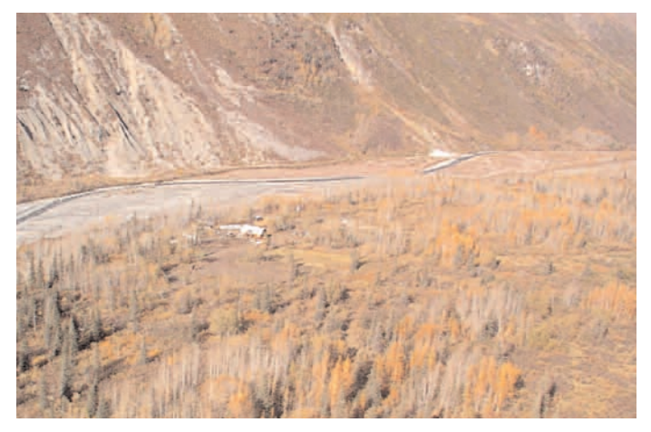
Above is the Pilgrim inholding inside Wrangell St. Elias National Park and Preserve. The family's access dispute with the National Park Service has attracted national media attention.

The State strongly urged the Park Service to evaluate ways "to quickly and simply provide inholders with the security of a permanent au-