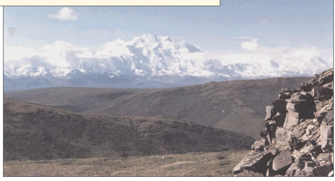
Mt. McKinley stands tall from the Gold King inholding on Quigley Ridge in Kantishna, Denali National Park. Within Alaska's na tional parks, there are more than 1.6 million acres of land owned by private individuals and Native corporations, the State of Alaska and local communities.

The Park Service received dozens of comment letters from individuals, Native corporations and governments on the draft describing how landowners and valid occupants can secure access rights under Section 1110 (b) of the Alaska National Interest Lands Conservation Act (ANILCA). This section of ANILCA addresses motor-