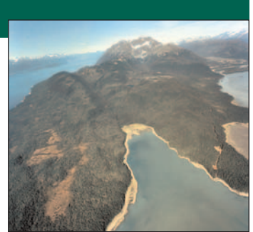
Coeur Alaska is proposing to develop the Kensington gold mine in the Tongass National Forest near Juneau.

developed as an underground mine with a 2,400 tons per day mill. Coeur Alaska expects to produce an average of 175,000 ounces of gold annually for 10 years. Kensington is located in the Tongass National Forest about 45 miles north of Juneau. Coeur has already in-