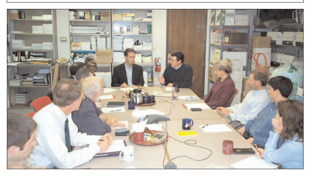
AMEREF board members meet with Lt. Governor Loren Leman to discuss creative solutions for maintaining a longstanding partnership between the State of Alaska Department of Education and the private sector in providing a balanced resource education program to Alaska schools.