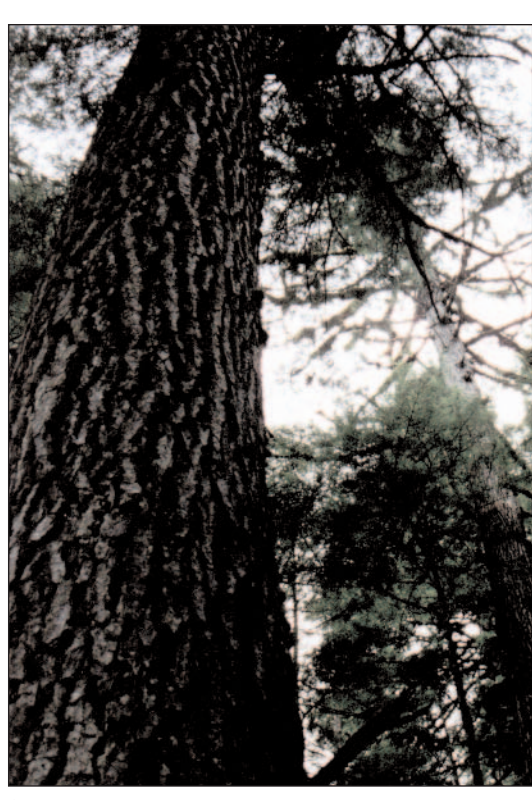
If Alaska is granted an exemption to the roadless rule, its two national forests will continue to be managed with an emphasis on preserving the wild character of the land. No commercial logging would occur in the Chugach and only 3 percent of the timber in roadless areas of the Tongass would be available for logging.

In addition to AML, the City and Borough of Juneau, Ketchikan, Wrangell, Seward, Valdez and the Kenai Peninsula Borough were among Southeast and Southcentral Alaska communities to support the