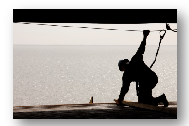
Health and Safety