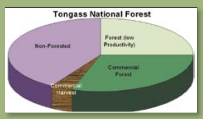
The Tongass has 10 million acres of forest.