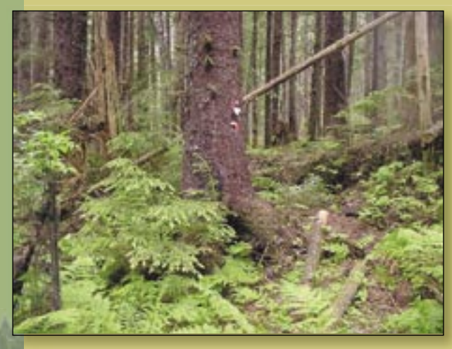
This 70 year old second-growth timber was thinned about 15 years ago and now has more volume per acre than the original old-growth.