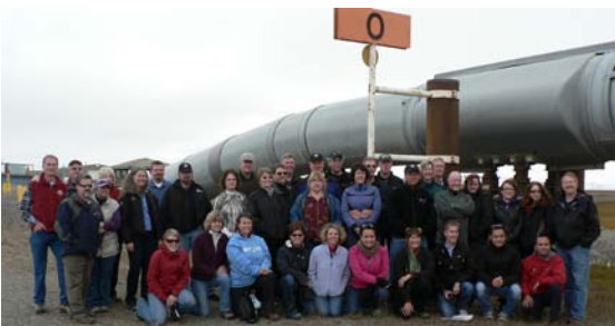
Milepost zero of the Trans-Alaska oil pipeline is a popular stop for North Slope tours.