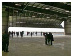
RDC visits the new Deadhorse Aviation Center as an 80'x20' hangar door opens to the airstrip.