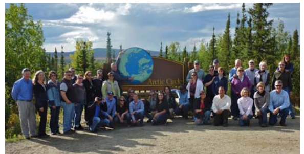
The RDC group gathers for a photo at the Arctic Circle, which is about 65 miles north of the Yukon River bridge.