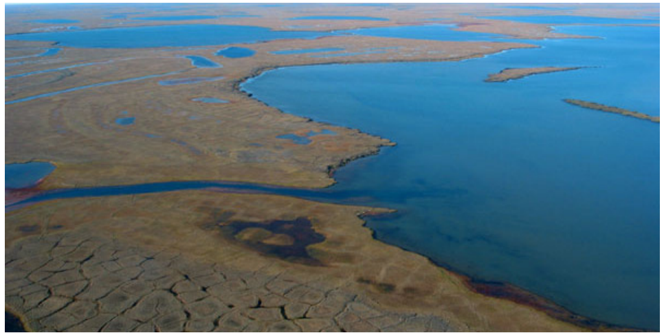
Over half of Alaska's non-mountainous lands are considered wetlands and less than one percent has been developed.

RDC warned that the joint guidance will affect wetlands, as well as the National Pollutant Discharge Elimination System (NPDES) permitting program, EPA's oil spill program, and state water quality certification processes. The guidance will have an impact