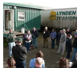
The Lynden Transport Terminal and yard was also on the itinerary.