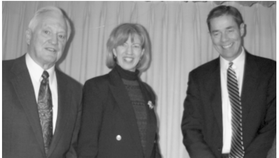
Interior Secretary Gale Norton visited Alaska last month with several U.S. Senators to tour North Slope oil fields and get a close up look at ANWR's Coastal Plain. Above, Norton poses with Governor Tony Knowles and former Governor Walter Hickel, who served as President Nixon's Interior Secretary. Norton spoke at a private luncheon attended by RDC, Alliance, Commonwealth North and Anchorage Chamber board members. An earlier breakfast meeting opened to members of the four organizations was cancelled due to late arrival of Norton's delegation.

"Recent violence in the Middle East reminds us how easily U.S. oil supplies are threatened," Knowles said. "As domestic oil consumption has increased 14 percent over the last decade, domestic production has lagged, falling 17 percent. Just 25 years ago, our nation imported only 35 percent of the (Continued to page 4)