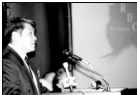
Mayor George Ahmaogak is a Barrow whaling captain.

The Eskimo view on development stems in part from our relationship to the land. We like to say that we are the original environmentalists. This is because our fate has always depended on the health of the animal populations that we harvest for survival. If you keep in mind that generations of our ancestors survived in the harshest habitable climate on earth without three of the four basic food groups, then it is easy to