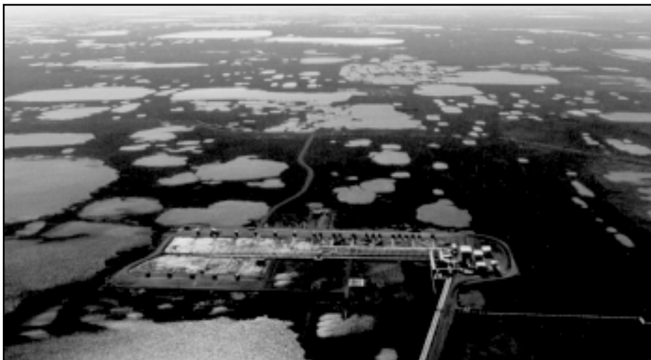
New technology has dramatically reduced industry's footprint on the North Slope.

"Current issues such as the energy crisis in California and our nation's growing reliance on imported oil, now at 57 percent of the nation's consumption, have brought the importance of developing a national energy policy to center stage," the letter concludes.