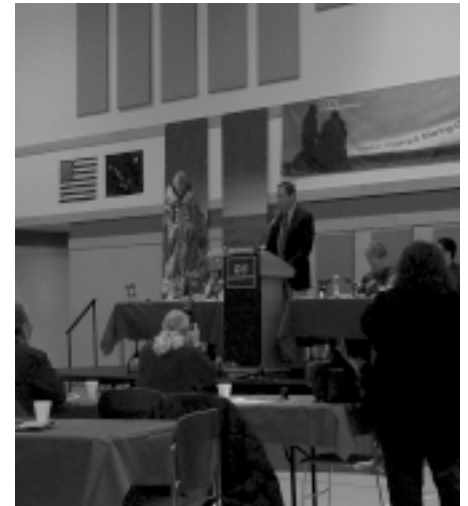
Governor Tony Knowles told summit delegates that the North Slope's resources of oil and gas have made a tremendous contribution to Alaska's economy. His remarks focused on education, transportation and public health/safety.

Development of a stakeholder process for resource/economic projects that takes into account local concerns;