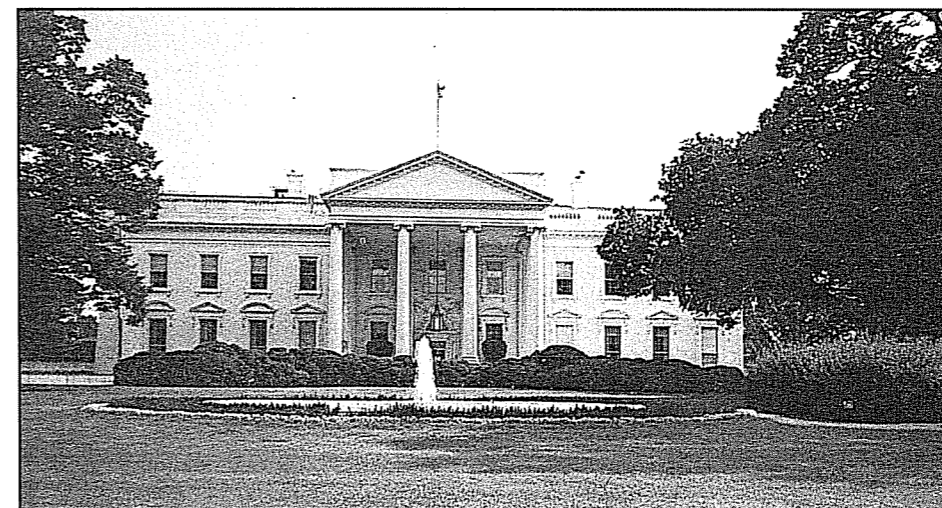
The White House's Clean Water Action Plan is just the beginning of a long-term effort by federal agencies to implement far-reaching watershed protection measures.

Resource Development Council 121 W. Fireweed, Suite 250 Anchorage, AK 99503 ADDRESS SERVICE REQUESTED