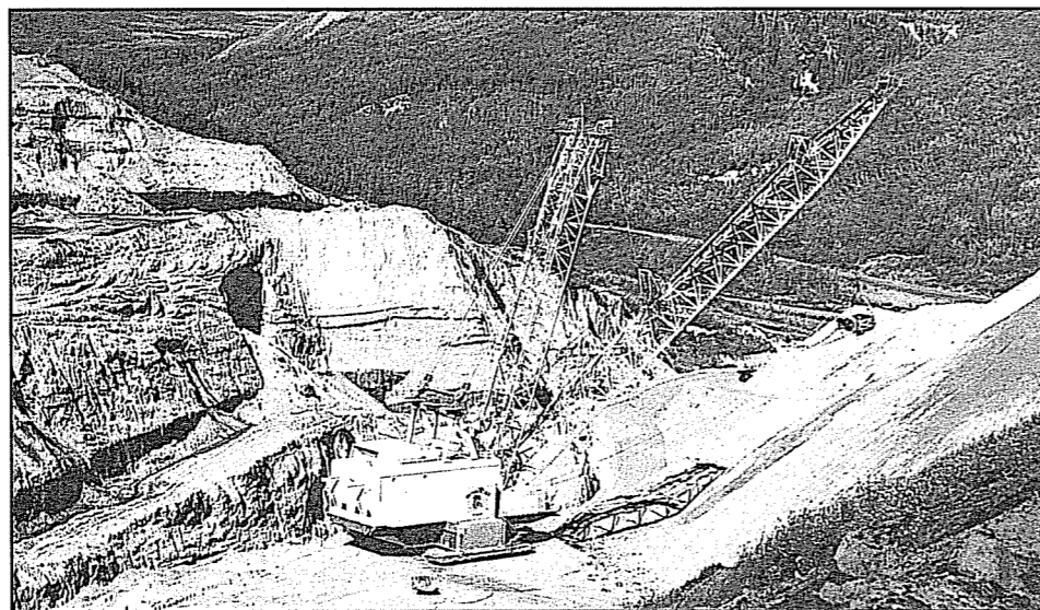
The new Clean Water Initiative will increase the role of the Clean Water Act in all resource industries. The initiative calls for addressing water quality issues through a watershed approach. Pictured above is the Usibelli Coal Mine at Healy.

In addition, the initiative would establish by 2002 more than two million miles of conservation buffers to reduce